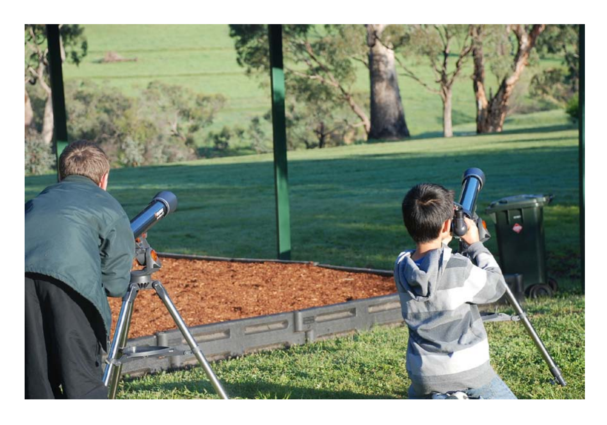
The boys are looking at ants on the branches at the top of the gum trees on the other side of the oval!