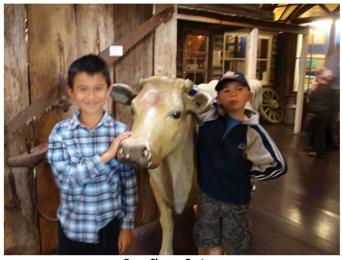
Bega Cheese Factory