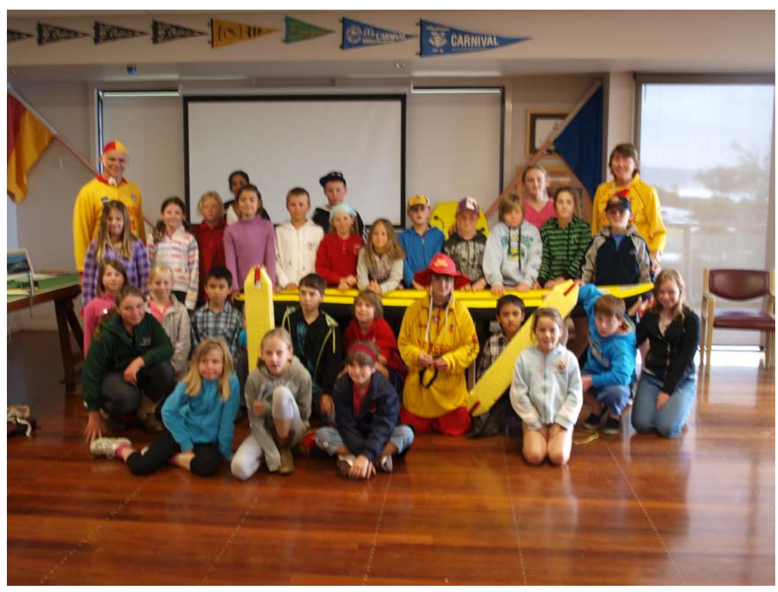
Learning surf survival skills at the Pambula Life Saving Club