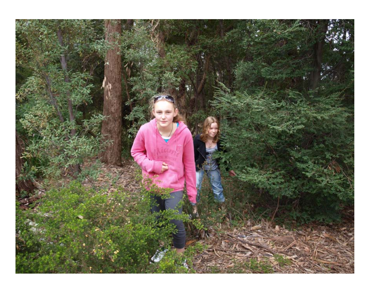
Adventures in the Botanical Gardens