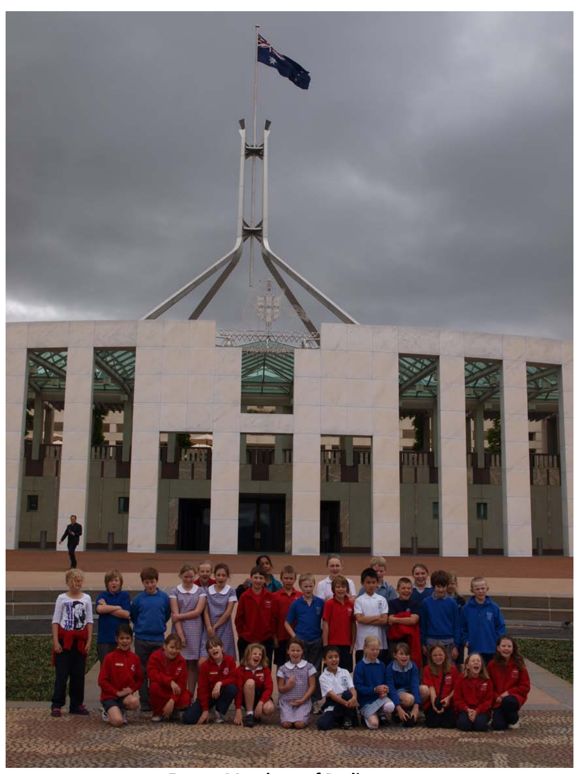
Future Members of Parliament