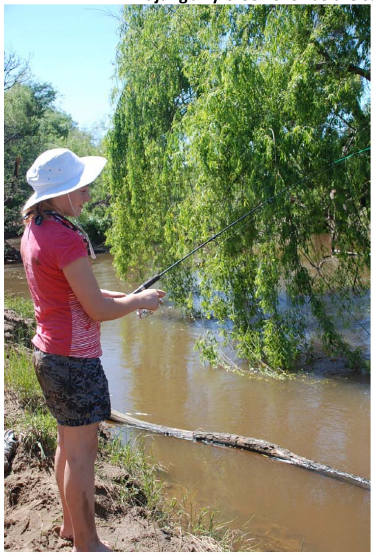
Waiting for the big

Will Adjungbilly Creek ever be the same again?