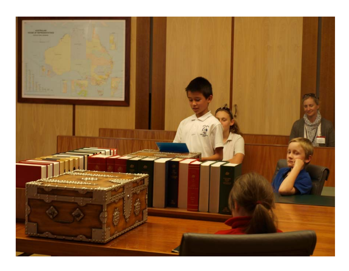
Action in the Chamber

Well it all started at six in the morning and we had to leave at seven from Tumut and get in a big bus with five more schools.