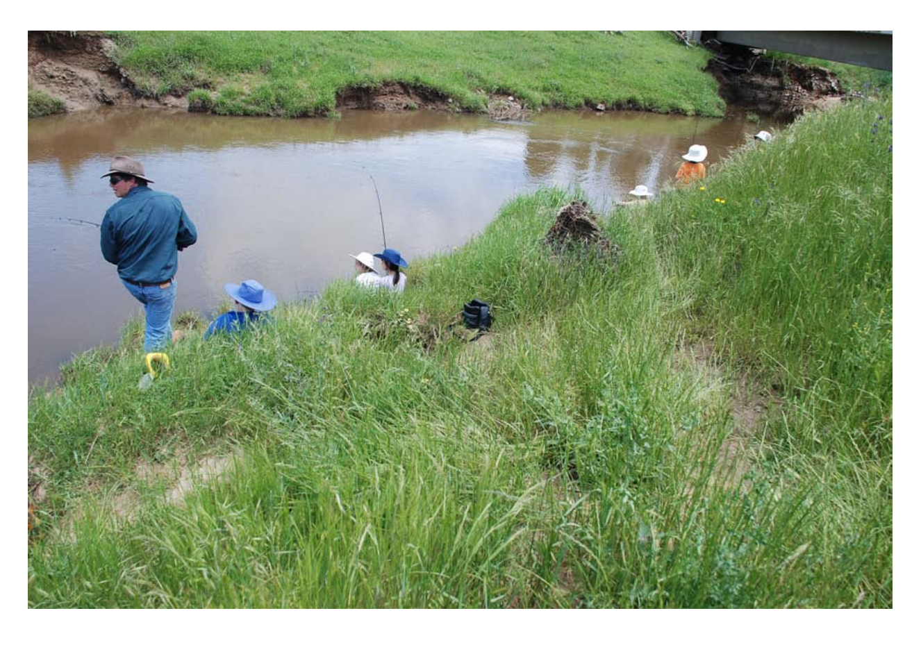
trout. There were some great stories of, 'The one that got away!'