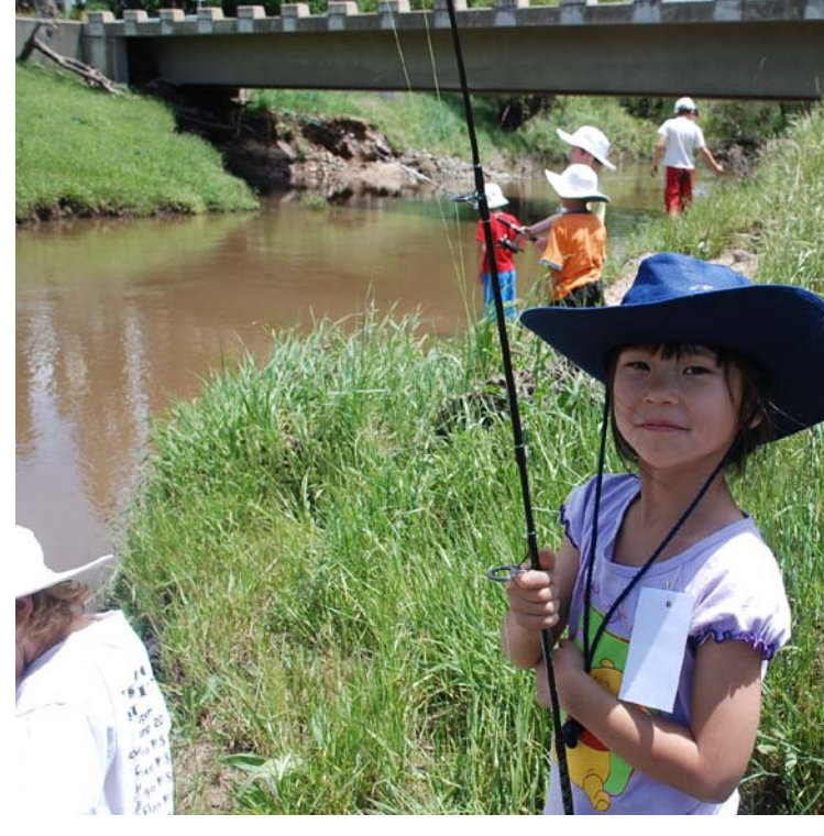
Both the senior and junior groups caught several brown