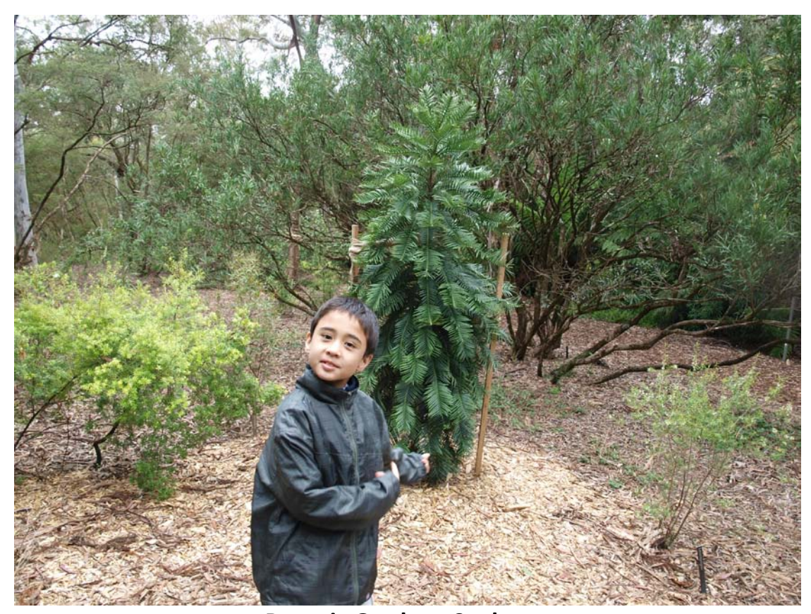
Botanic Gardens Canberra