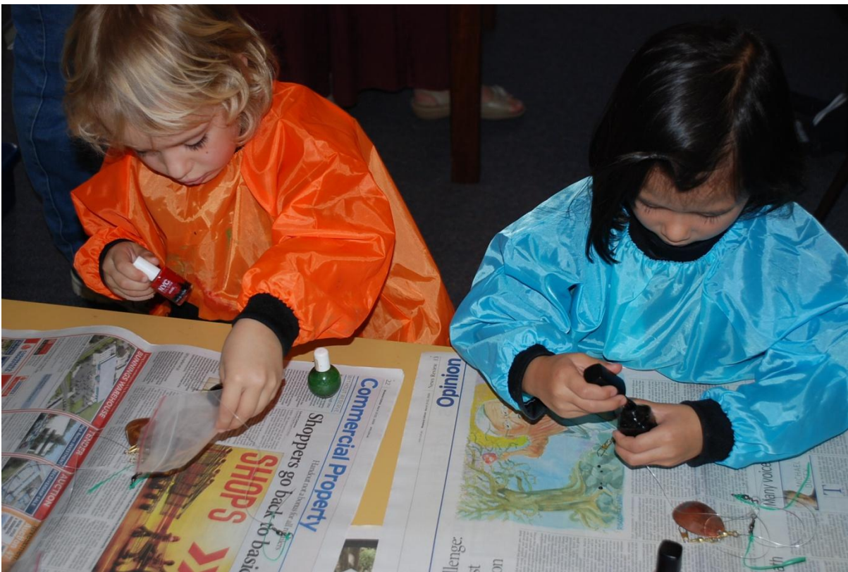
The smell of nail polish wafted through the room as the lures hand painted designs took shape.