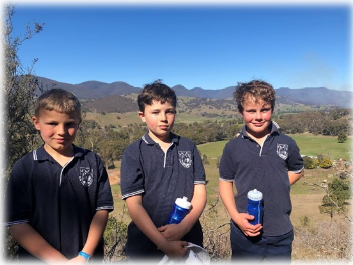
Half way to our goal