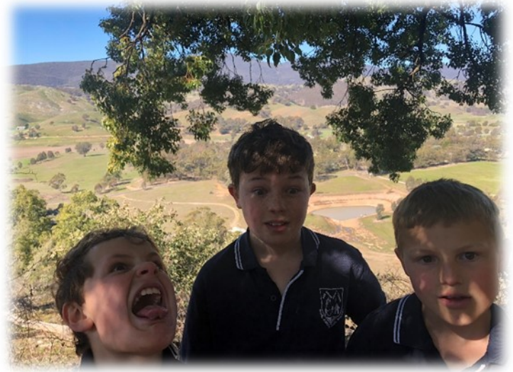
How they really felt